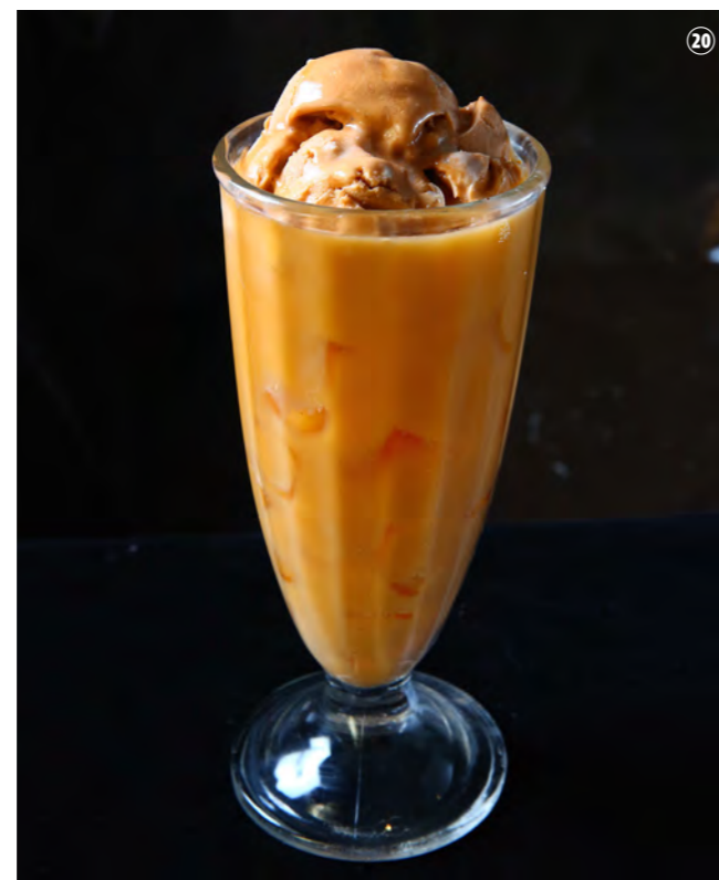
ICE THAI TEA FLOAT