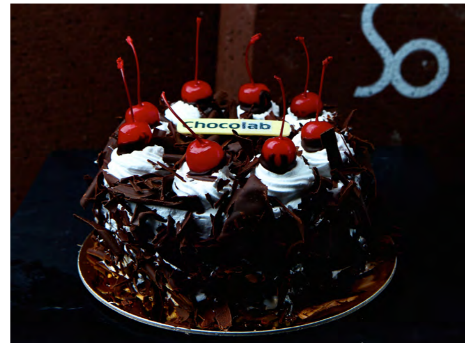
BLACK FOREST CAKE