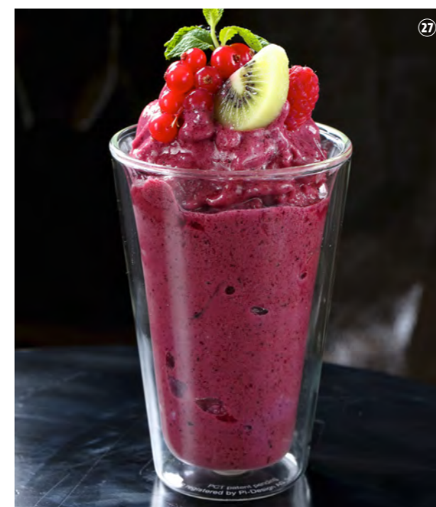
MIXED BERRIES FRAPPE