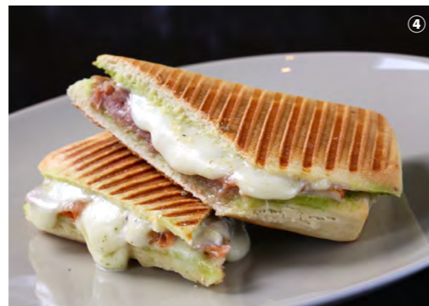
PARMA HAM & MOZZARELLA