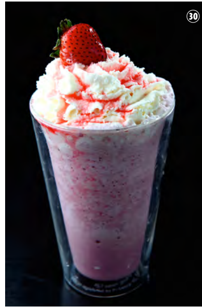
STRAWBERRY MILK SHAKE