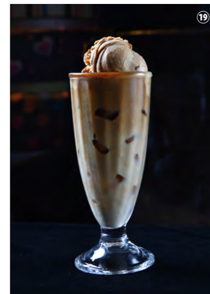
ICE MOCHA FLOAT