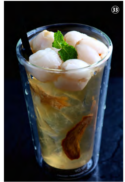
LYCHEE GINGER ICED TEA