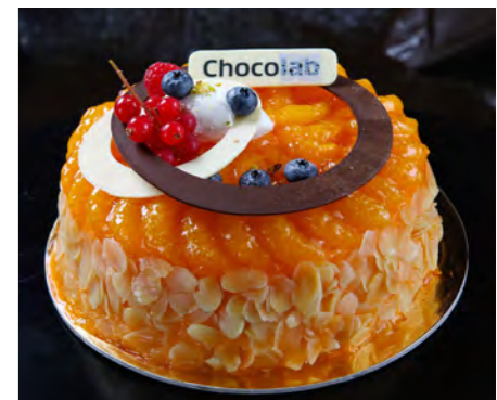
SO' ORANGE CAKE