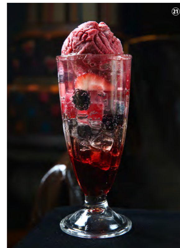
ICE BERRY SODA FLOAT