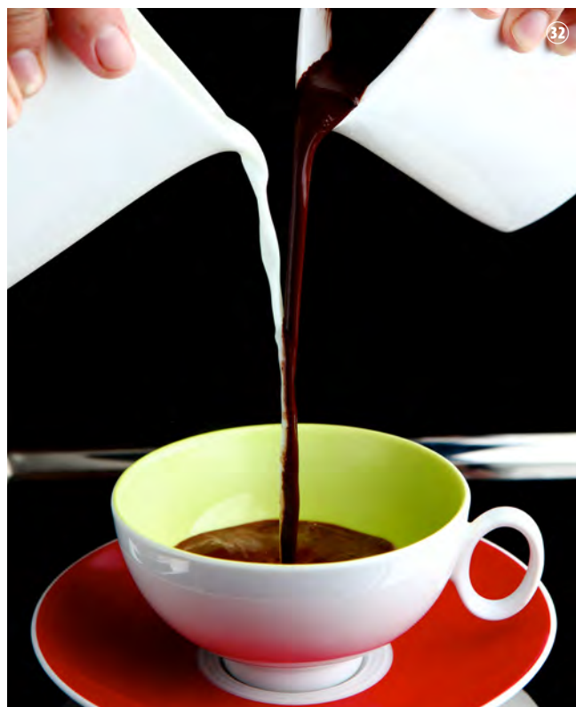
CHOCOLAT CHAUD À L'ANCIENNE