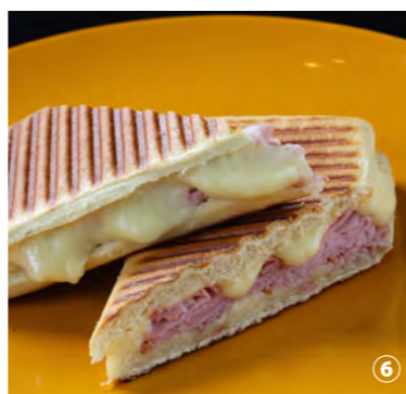
HAM & CHEESE