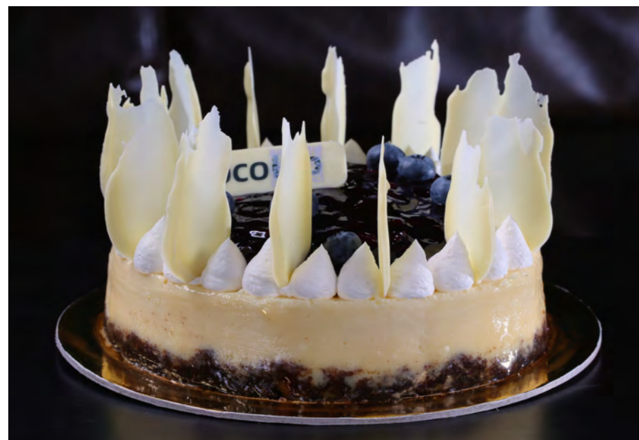
BLUE SHE'S CAKE

*CAKES ARE MADE TO ORDER AT THB 1,200 NET FOR 6 - 8 SERVINGS