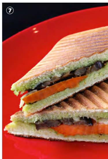
GRILLED VEGETABLES WITH PESTO & PAMESAN CHEESE