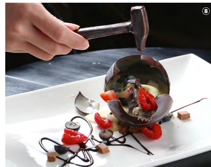
CHOCOLAB CRACKING BALL