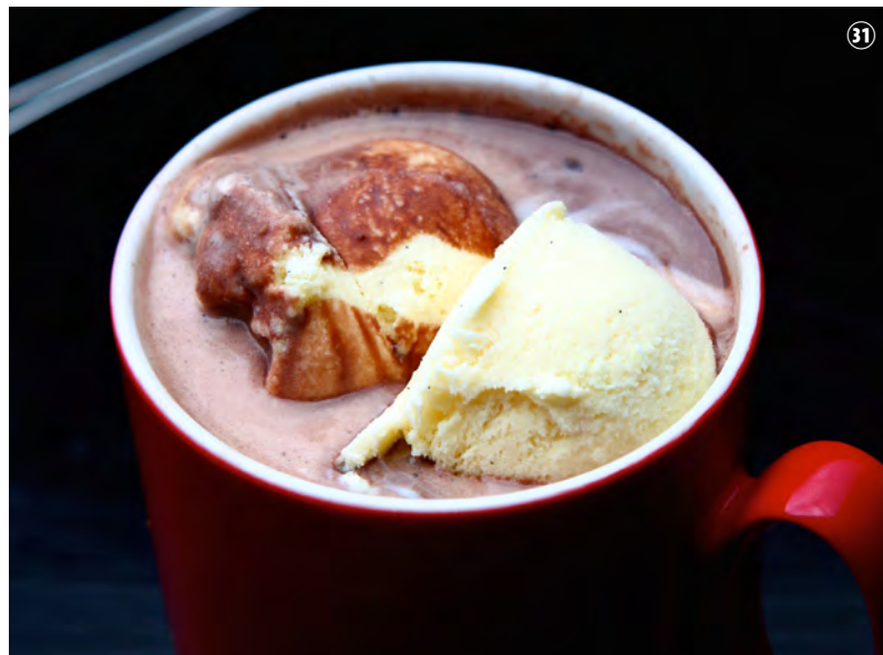
HOT CHOCOLATE VIENNA