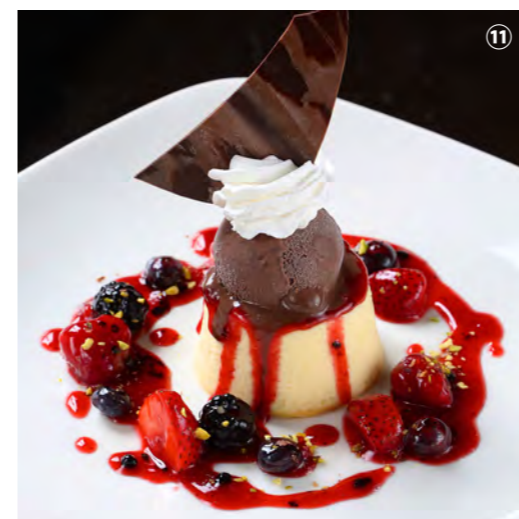
WARM CHEESE CAKE