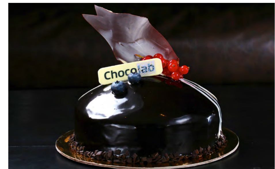
CHOCOLATE MOISTY CAKE