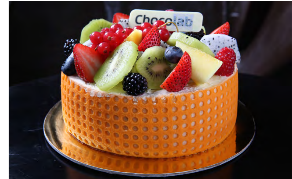
SO' FRUITY CAKE