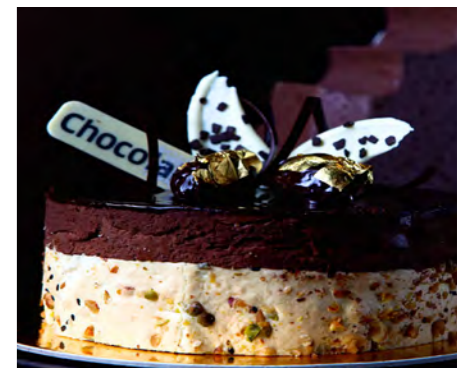
SO' ROYAL CAKE