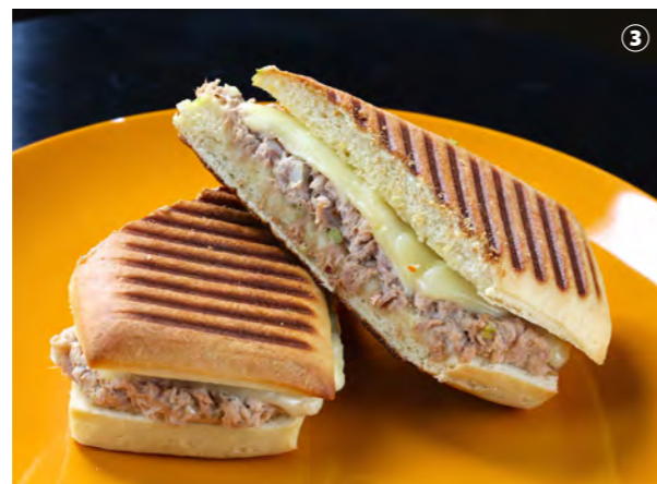
TUNA & CHEESE