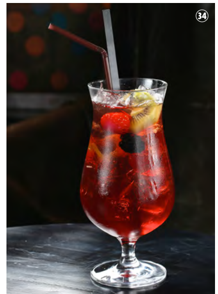
MIXED BERRY ICED TEA