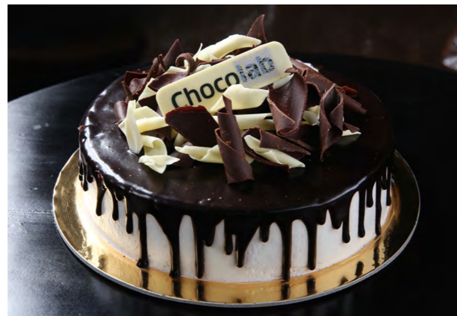
BLACK AND WHITE CHEESE CAKE