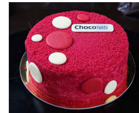
RED VELVET CAKE