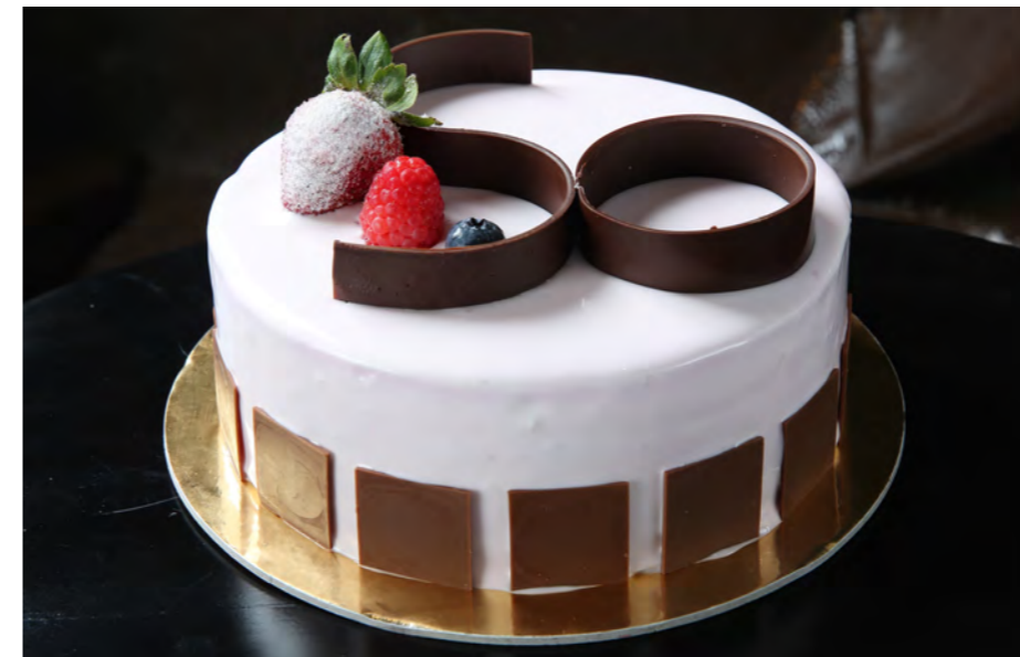
WHITE SO' BERRY CAKE