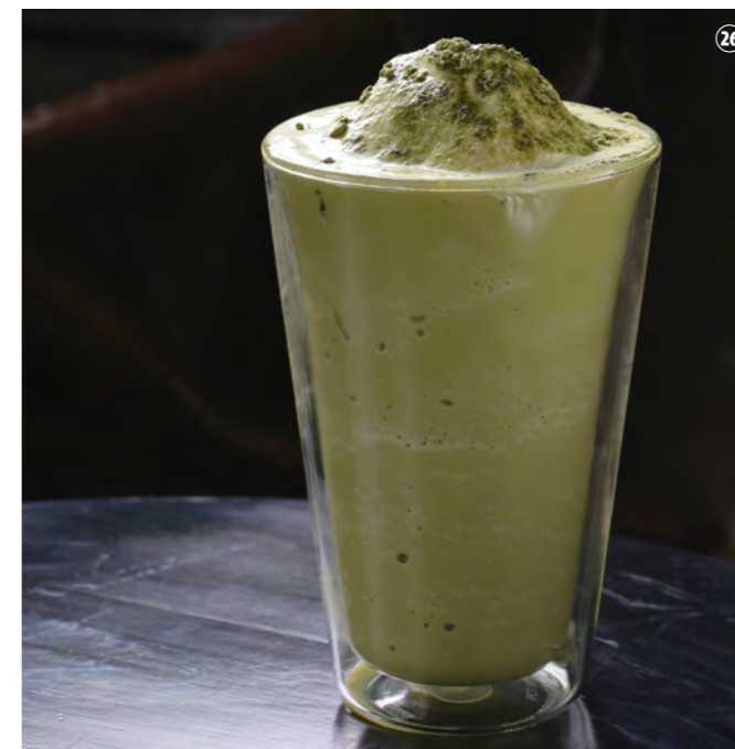
GREEN TEA FRAPPE