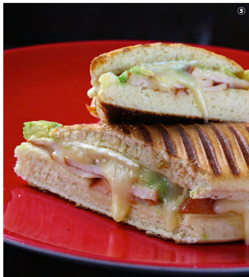
CHICKEN, BRIE CHEESE & AVOCADO