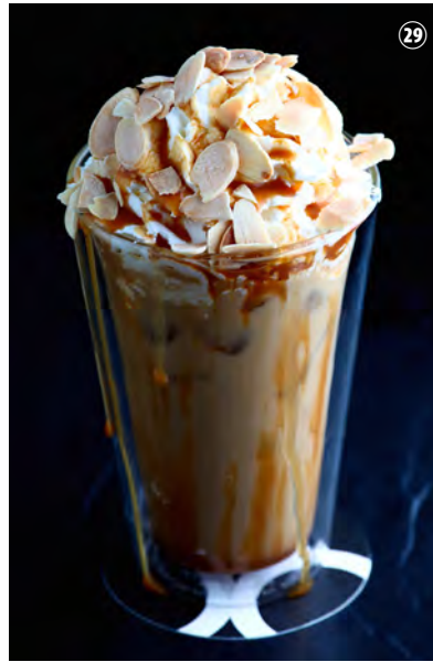
SO' NUTTY WHITE CHOCOLATE LATTE

All prices are quoted in Thai Baht and subject to 10% service charge and 7% government tax