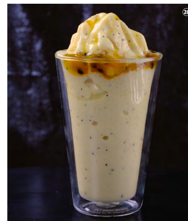
PASSION FRUIT FRAPPE