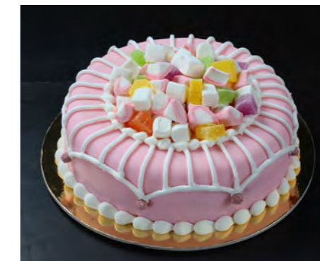
SO' BERRY AND MARSHMALLOW CAKE