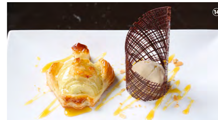
WARM APPLE TART