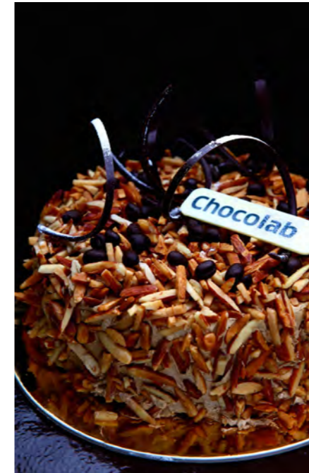
ALMOND MOCHA CAKE

It was not until the middle of the 19 th century that cake as we know it today (made with extra refined white flour and baking powder instead of yeast) arrived on the scene. A brief history of baking powder. The Cassell's New Universal Cookery Book [London, 1894] contains a recipe for layer cake. Butter-cream frostings began replacing traditional boiled icings in first few decades 20 th century. In France, Antonin Careme [1784-1833] is considered THE premier historic chef of the modern pastry/cake world. You will find references to him in French culinary history books.