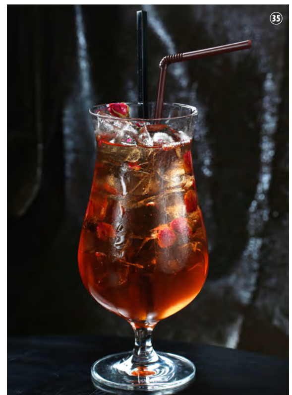
ROSE ICED TEA