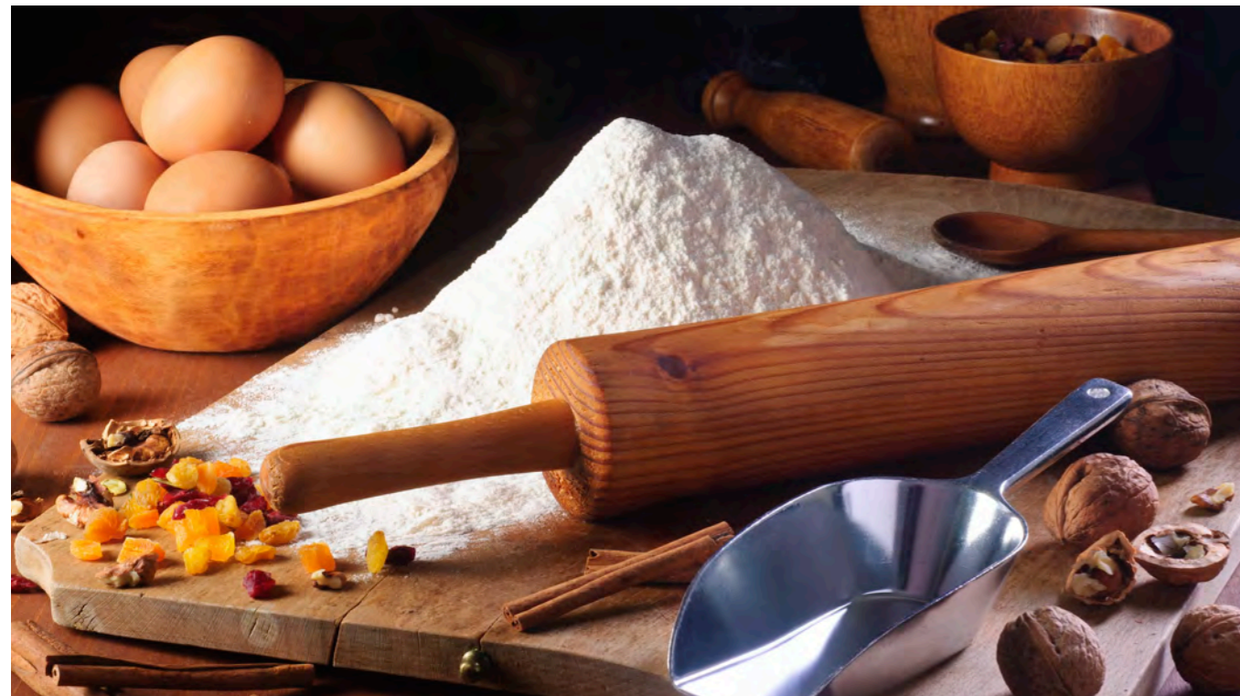
A party without "cakes" is just a meeting! by Julia Child

THE HISTORY OF CAKE DATES BACK TO ANCIENT TIMES. THE FIRST CAKES WERE VERY DIFFERENT FROM WHAT WE EAT TODAY. THEY WERE MORE BREAD-LIKE AND SWEETENED WITH HONEY. NUTS AND DRIED FRUITS WERE OFTEN ADDED.