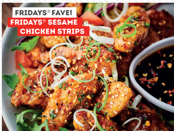
FRIDAYS® FAVE! FRIDAYS® SESAME CHICKEN STRIPS

Crispy chicken breast chunks, tossed in Frank's® RedHot sauce and chillies with a blue cheese dip