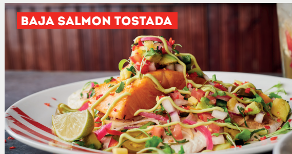
BAJA SALMON TOSTADA

Crisp flour tortillas topped with salmon, vegetables, spicy guacamole, pineapple pico de gallo, fresh red chillies in a zingy pineapple and jalapeño glaze, drizzled with avocado cream