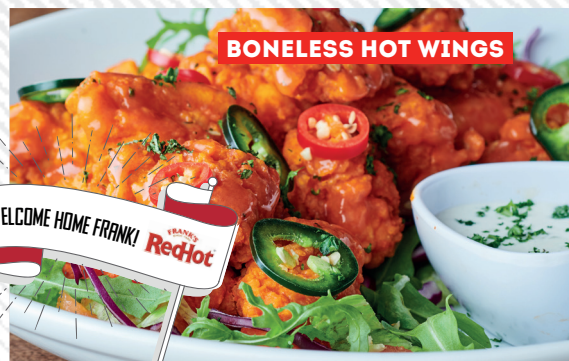
BONELESS HOT WINGS